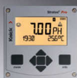
Orange: HOLD mode