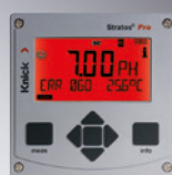
Red flashing: Alarm, error