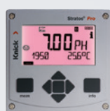
Magenta: Maintenance request