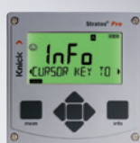
Green: Info texts