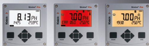
White: Measuring mode